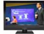
Results Dissemination/ communication