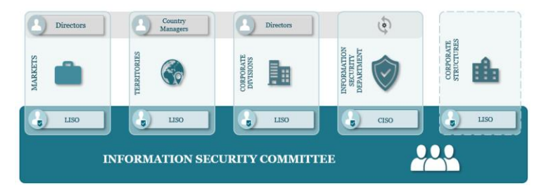
Figure I - Organisational structure and roles

The following figure shows the divisions and the communications between the organisational units, supervisory bodies and the individual roles involved.