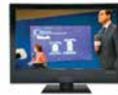
Publications of results