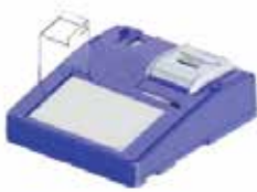
Biometric Identification Kits