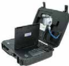
Biometric Registration Kits