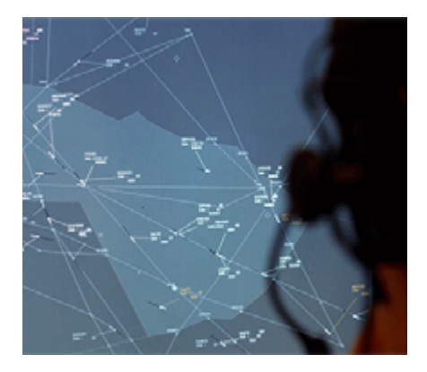
ATC Automation Systems