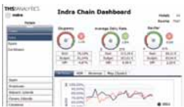
ERP - Analytics