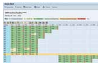
PMS + CRS