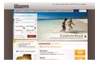
Web + Mobility